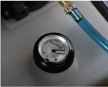
Easy To Operate