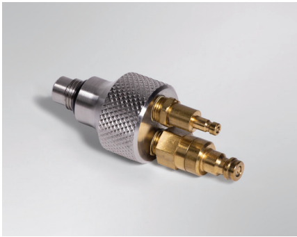
Fast & Efficient Set Up